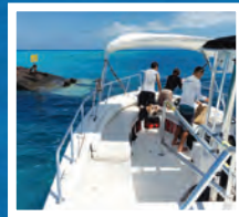
Premium: Snorkel Boat

Our private snorkeling boats offer families, couples, and friends the unique opportunity to visit some amazing offshore sites where the snorkeling is superb! Experience beautiful coral reefs, tropical fish, sea turtles, shipwrecks and more. These tours are customized to your liking and cater to all skill levels of snorkelers and groups of all sizes. It's fun for everyone!